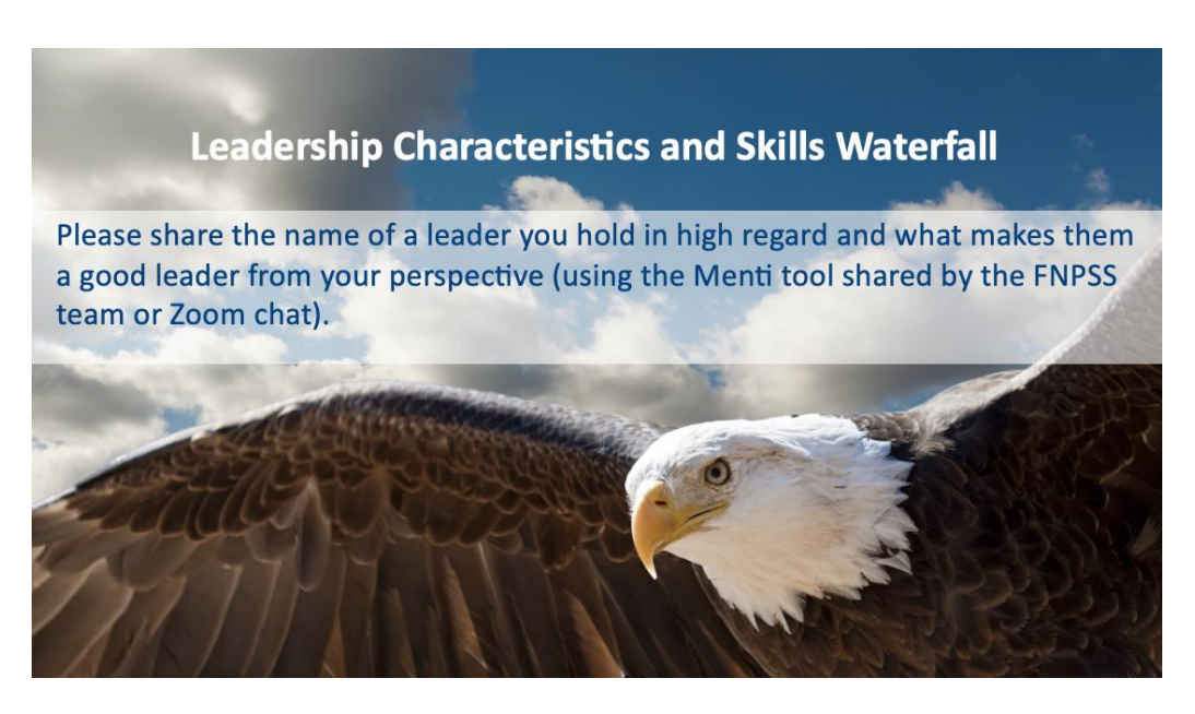
Sample engagement slide from Pre-Engagement workshop.

I enjoyed the session tonight, very informative. The information shared from everyone was great, there was information that can be forwarded to our Chief and Council and any of our management.